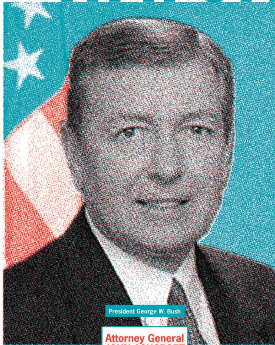
President George W. Bush